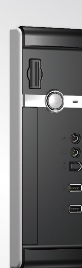
PC78131 (Exclusive in UK)