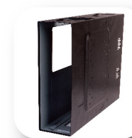
Optional LCD VESA mounting kit with cable management