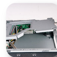
Removable drive cage

Front Control : System Reset (Bezel Dependent), IEEE 1394 (Option)