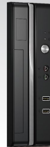
PC78137 (Exclusive in UK)