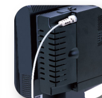
Optional cable management bracket (for kit 2)