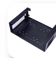
Optional LCD VESA mounting kit 2