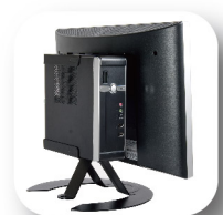
Optional PC stand