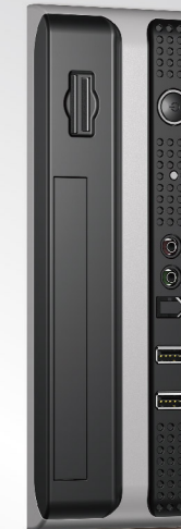
PC78167 (Exclusive in UK)